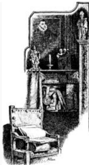
A bit of Dutch history

"I have some new pictures to show you," was his greeting as we looked into his studio one summer morning, and in spite of our