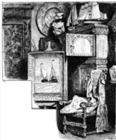
Corner at Mesdag's

The studios are two large rooms, overlooking the garden at the back of the house and connected by folding-doors the panels of which have been decorated by the artists' fellow-painters. Each room is lighted by a large sheet of plate glass, which furnishes a pure out-of-door light, and the harmonious and luxurious warmth of color surrounding us is a constant source of pleasure. A few choice pictures by various masters, ancient and modern, mirrors in quaint old frames, and beautiful tapestries, cover the walls. Two fine oaken cabinets are covered with models of every variety of Dutch craft, and others are filled with costly bric-à-brac. The Smyrna carpet, the carved chairs and tables, and the oddities of costume peculiar to the peasant people of the Old World, combine to make every corner and bit of wall a fine still-life, and yet form a broad and simple background for the numerous pictures on easels about the room.