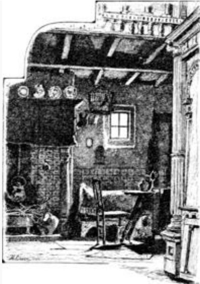
In the studio of Bloomers

The white walls with wainscoting of oak are graced by old pictures, among them a Quentin Matsys and a Holbein ; the unplastered ceiling shows the dark wood of the beams and the floor above. Old Delft tiles line the great fireplace, and the projecting chimneypiece of finely carved wood, from which hangs a beautifully embroidered valance, supports choice specimens of old blue ware. On the hearth below glitters a brazen stand of curious workmanship, on which dames of old were wont to brew their tea; while in a neighboring corner a graceful antique silver tea set bears testimony to the friendship of the late Queen of Holland, and is a reminder of her frequent visits.