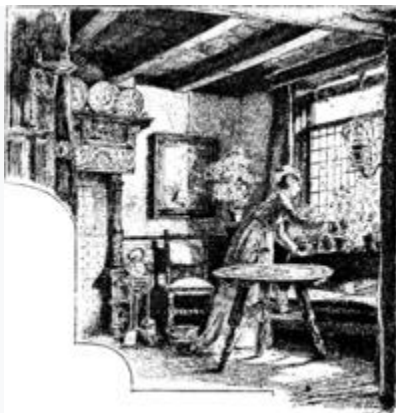
A Dutch parlor

the north by a large plate-glass window; the wall opposite is paneled with oak almost to the ceiling, and at one end of the room are tables, chests, and corner shelves filled with bric-à-brac. The opposite end is entirely open, and admits us into a low room that is a fac-simile of a fisherman's cottage, with an open fire-place lined with tiles, a heap of fagots on the hearth, and the inevitable shining brass tea-kettle suspended on an iron crane. Old Dutch ware decorates the chimneypiece, and the wainscoting is of blue tiles, which, like all the furniture, were collected by the painter from peasant homes. Here Mr. Bloomers poses his models, using the other room simply as an atelier. An open door and a low window light the "cottage" from the north, but quite another effect may be obtained by closing these and opening a small high east window. Again, the entire feeling of the place may be changed by admitting the light from the south only. On that side there is a large window of old Flemish design, with diminutive panes, complicated oaken shutters, and finely wrought latches and hinges, which admits of great variety in the amount and direction of light. Various screens and a green baize curtain on a swinging bracket beside the studio window are so arranged as to prevent the light of one room interfering with that of the other. Our sketch was taken from the studio, just showing the dividing line between it and the cottage, with a view of the chimney and the east window.