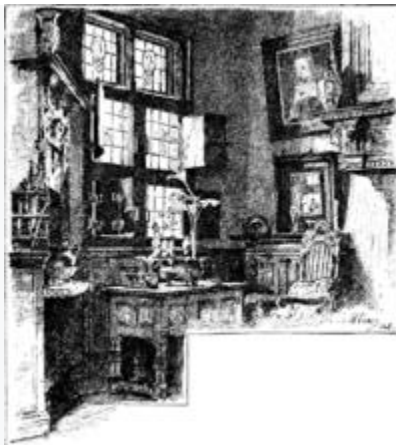
In Bisschop's house

Perhaps one of the greatest charms of these Dutch studios is the marked individuality we find in each, and the perfect harmony of the surroundings with the tastes and works of the painter. Nowhere has this impressed us more vividly than in the beautiful studio of Mr. Johannes Bosboom, who is famous for his church-interiors.